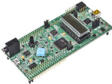
Fig 1 ST Microcontroller Board

The STM32L476xx devices are the ultra-low-power microcontrollers based on the high-performance ARM® Cortex®-M4 32-bit RISC core operating at a frequency of up to 80 MHz. The Cortex-M4 core features a Floating-point unit (FPU) single precision which supports all ARM single-precision data-processing instructions and data types. The STM32L476xx devices embed high-speed memories (Flash memory up to 1 Mbyte, up to 128 Kilobyte of SRAM), a flexible external memory controller (FSMC) for static memories, a Quad SPI flash memories interface and an extensive range of enhanced I/Os and peripherals connected to two APB buses, two AHB buses and a 32-bit multi-AHB bus matrix.